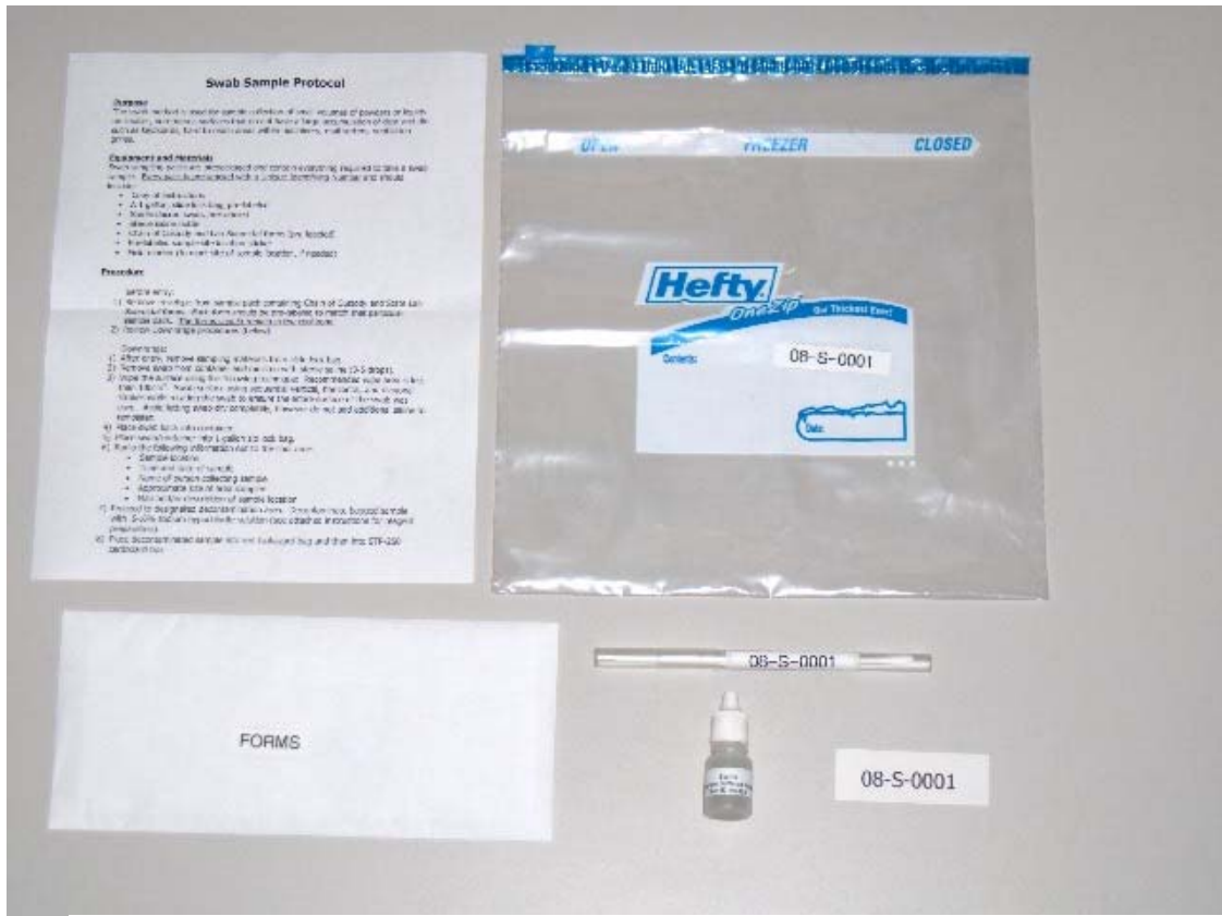
Pictures show one swab sample kit complete with: Sampling Protocol, State Lab and Chain of Custody Forms, sterile swab, saline bottle, secondary containment (Ziploc) bag), and field location marker.

26) Place decontaminated sample into red biohazard bag and then into STP-250 cardboard box.