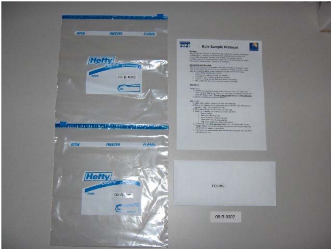
Pictures show one bulk sample kit complete with: Sampling Protocol, State Lab and Chain of Custody Forms, Primary and Secondary Zip Lock bags, and field location marker.