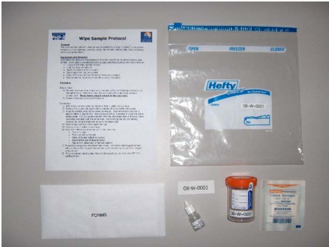
Pictures show one wipe sample kit complete with: Sampling Protocol, State Lab and Chain of Custody Forms, sterile specimen cup, saline bottle, sterile 2x2, secondary containment (Ziploc) bag, and field location marker.