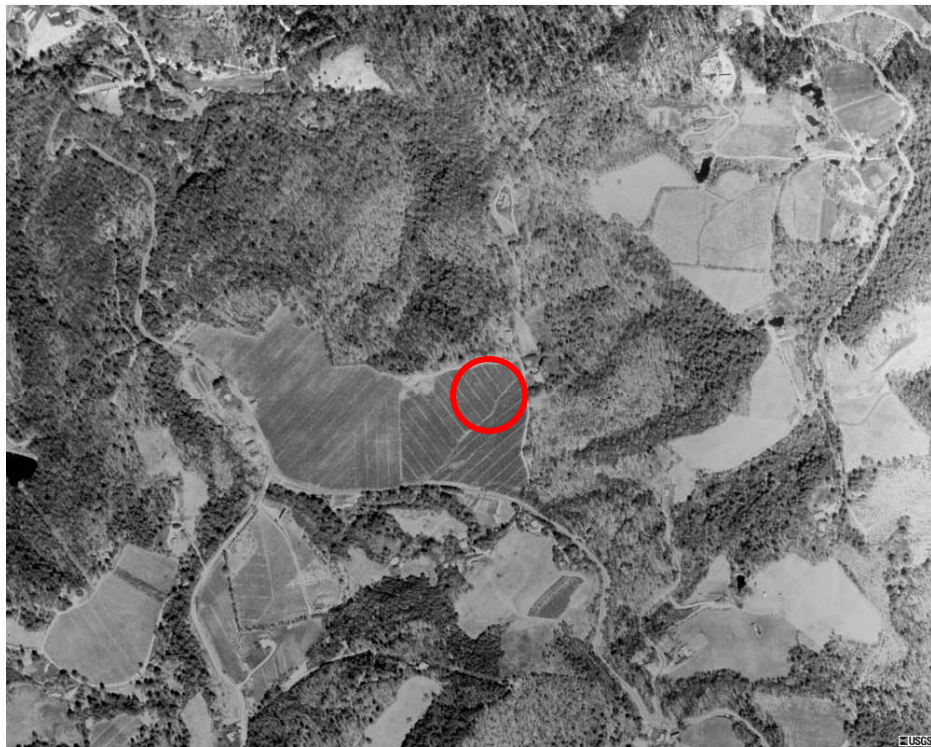
USGS Orthophotoquad: Glenville 7.5' Quadrangle 4-12-93