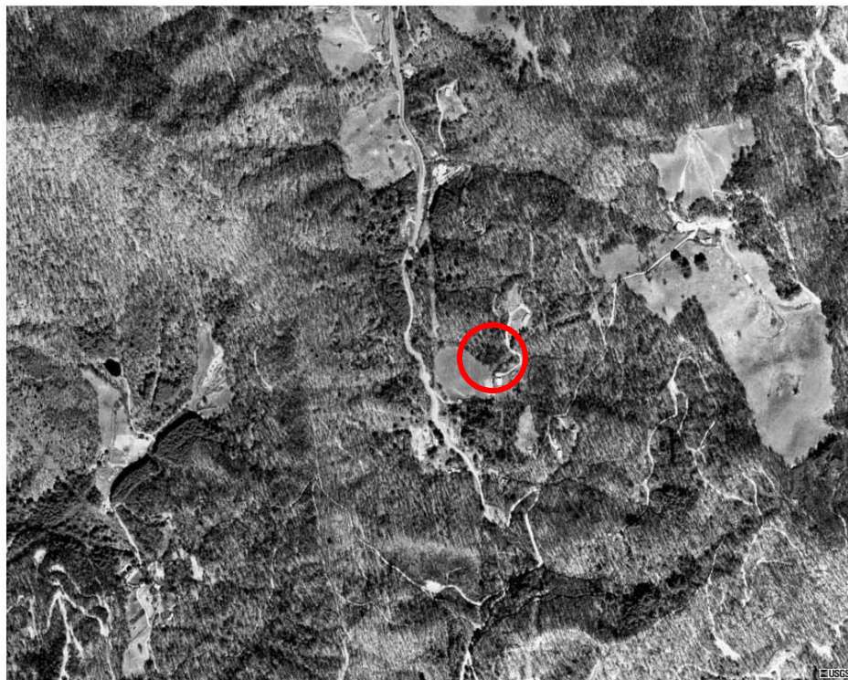
USGS Orthophotoquad: Sylva North 7.5' Quadrangle 4-12-93