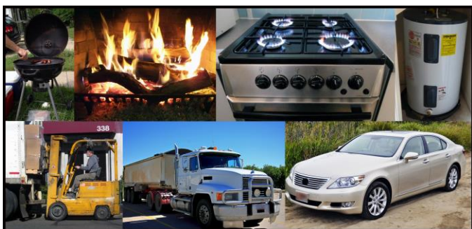
Table. 28 Emergency Department (ED) visits related to unintentional, non-fire related carbon monoxide (CO) poisoning in North Carolina were identified.